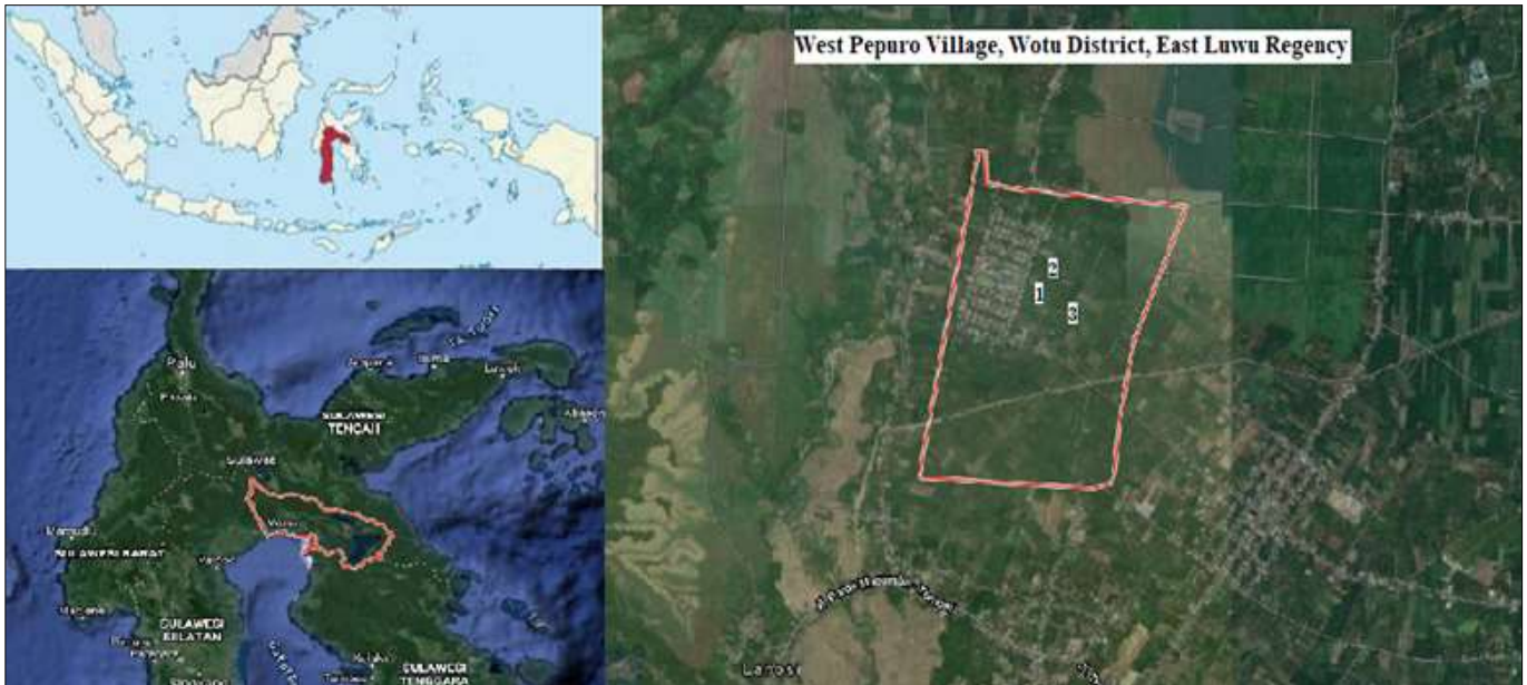
Fig 1: The study locations in West Pepuro, Wotu District East Luwu Regency

(Figure 1), in January 2020. The collected samples were honey and bee bread from three different colonies. The shape of the pollen found in the honey and bee bread samples was matched with the fresh flower pollen in the surrounding meliponary. The sample collection of fresh flower pollen was taken within a radius of 100 m in the morning or according to the blooming time of the flowers. The source of food plants around the meliponary was measured by the nearest distance from the bee hives.