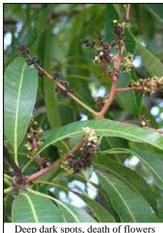
Fig 2: Typical symptoms in inflorescence

Panicle anthracnose or blossom blight can affect both the inflorescence stalk and the individual flowers. In the stalk, elongated dark gray to black lesions appear. Blighted flowers are dry, and their color varies from brown to black. Deep dark spots, causing the death of flowers. Fruits may fall (Fig. 2).