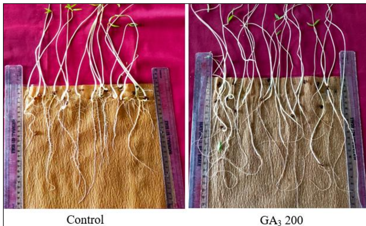
Plate 1: Effect of priming on seed quality parameters of green gram seeds

The highest germination percent was recorded on seeds primed with \text{GA}_3 (200 ppm) of 94 per cent and the lowest 70 per cent was recorded in NaCl (5%) primed seeds. The highest root length was observed in \text{GA}_3 (200 ppm) with 16.55cm and lowest was observed in \text{KH}_2\text{PO}_4 (2%) with 7.28 cm (Table 1). The longest shoot was recorded in \text{GA}_3 (200 ppm) priming with 25.95 cm and the lowest was observed in \text{KH}_2\text{PO}_4 (2%) priming with 19.36 cm irrespective of seed treatment (Table 1). The highest dry matter production was recorded with 0.20 \text{g}/10 \text{ seedling}^{-1} followed by 0.18 \text{g}/10 \text{ seedling}^{-1} in \text{GA}_3 (200 ppm) priming by hydro priming and the least in \text{KH}_2\text{PO}_4 (2%) with 0.11 \text{g}/10 \text{ seedling}^{-1} (Table 1). \text{GA}_3 (200 ppm) treated seeds showed highest vigour index of 3995 and least was observed 1970 in NaCl (5%) primed seeds (Table1).